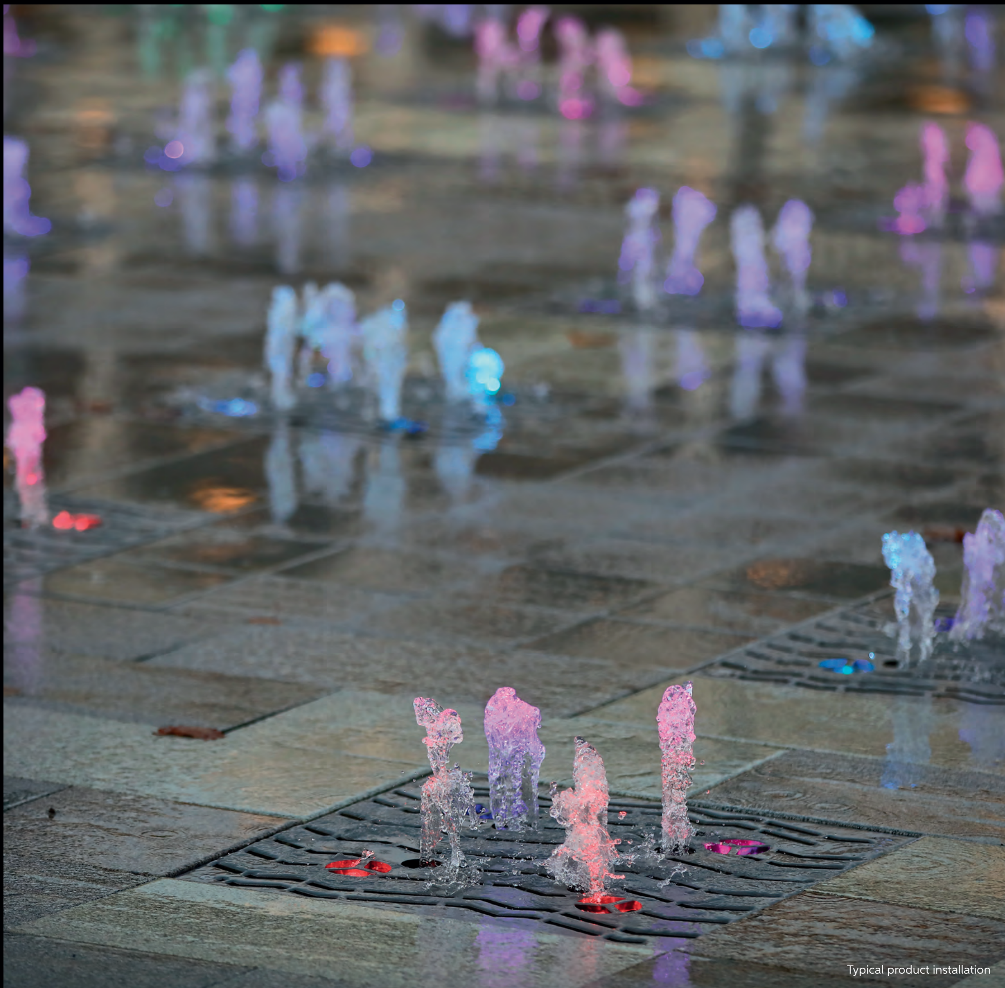
Typical product installation